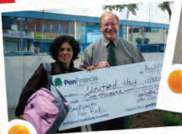
$1,000 donation to the United Way for the Backpacks for Kids Program.