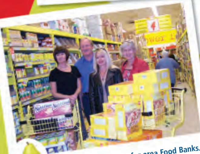
$1,500 shopping spree for area Food Banks.