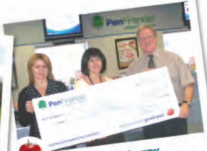
FACS receives a $2,000 summer camp program donation.