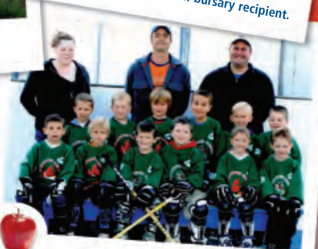
Ball hockey Niagara team sponsorship.