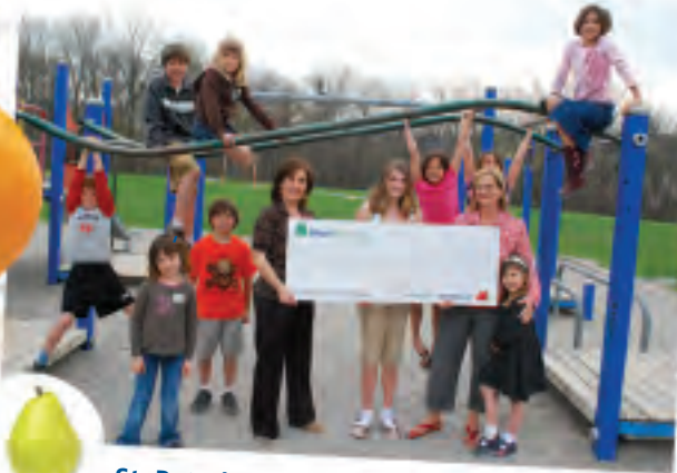
St. Peter's school receives $500 donation towards new playground equipment.

9-460 St. David's Rd. St. Catharines 905-641-2662